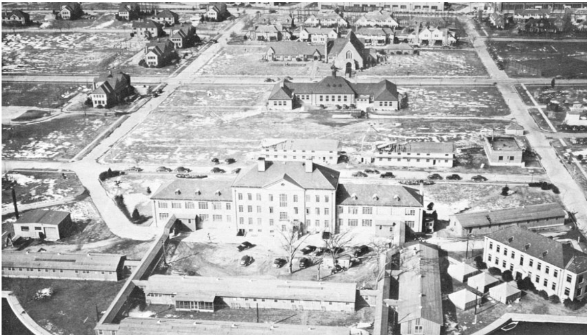
Expansion of Langley Field – 1941

I was assigned to Base Personnel when the flying mission was downsized. I stayed at Langley for four and a half years, married a Newport News girl, and had my first son there. I moved on in October 1948 to the Berlin Airlift.